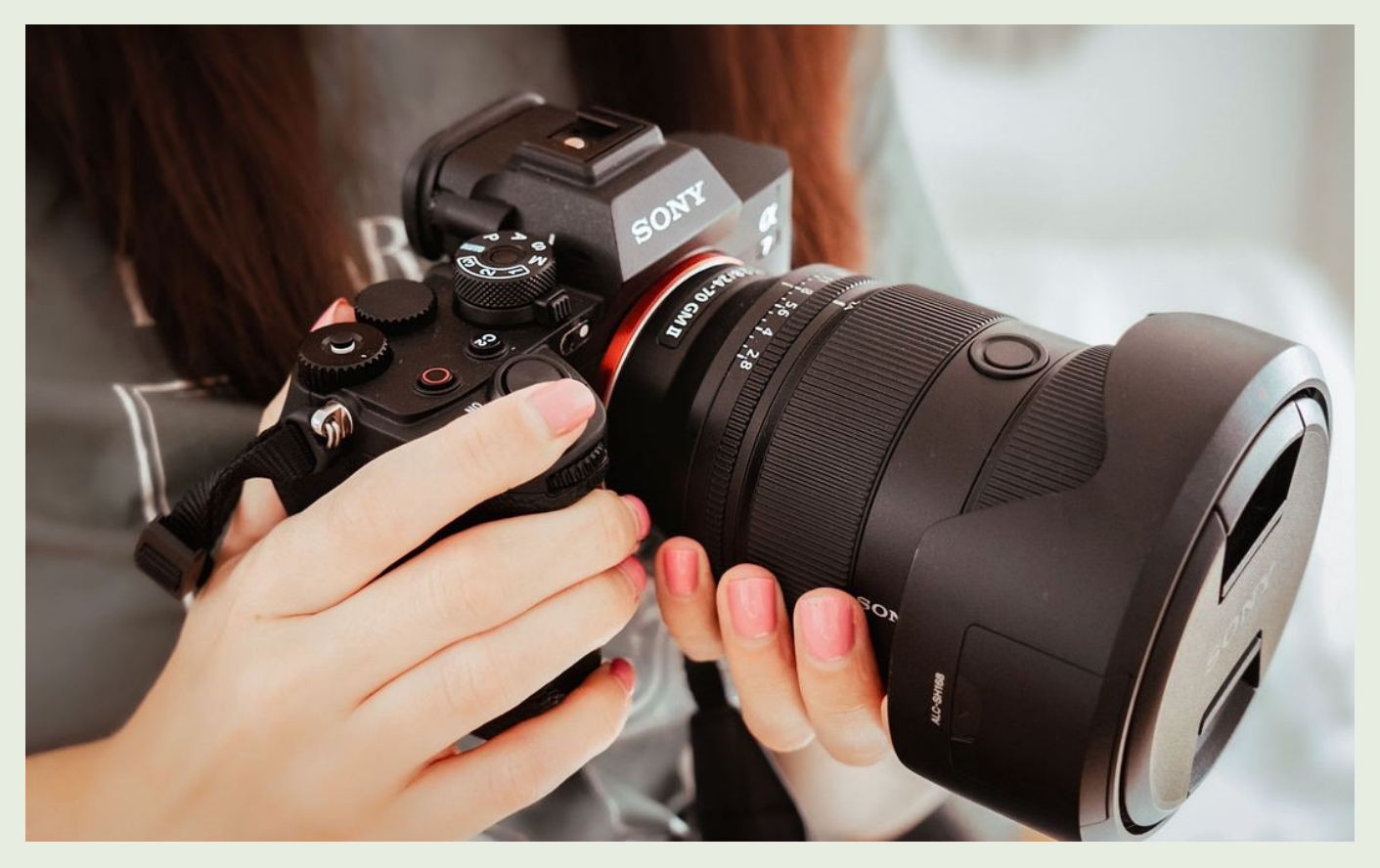
The NADE Communications director will be giving out prizes for your photos and Newsletter.