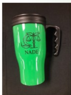
NADE TRAVEL MUG $11.00