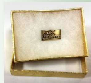
LAPEL PINS $6.00 EACH