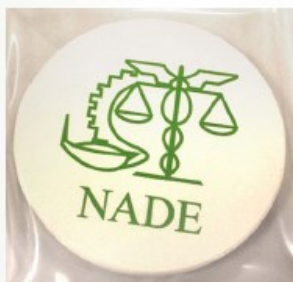
ABSORBENT STONEWARE COASTERS $7.50