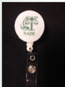
NADE LANYARDS $6.00