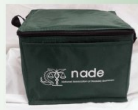
INSULATED COOLER BAG $7.50