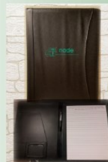
EXECUTIVE PORTFOLIO WITH PAD AND PEN $25.00

All proceeds to benefit NADE/Non-Dues Revenue http://www.nade.org/join-nade/nade-merchandise/