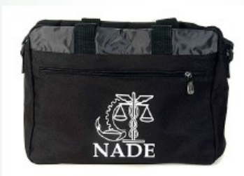
CARRYING CASE $20.00