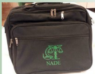
DELUXE LAPTOP BRIEFCASE $35.00