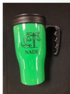
NADE TRAVEL MUG $11.00