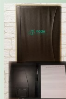
EXECUTIVE PORTFOLIO WITH PAD AND PEN $25.00

All proceeds to benefit NADE/Non-Dues Revenue http://www.nade.org/join-nade/nade-merchandise/