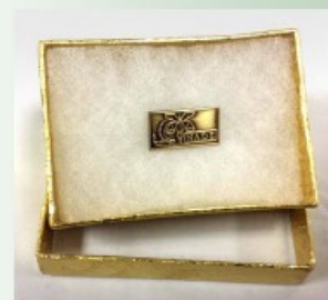
LAPEL PINS $6.00 EACH