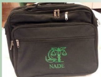
DELUXE LAPTOP BRIEFCASE $35.00