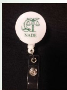
NADE LANYARDS $6.00