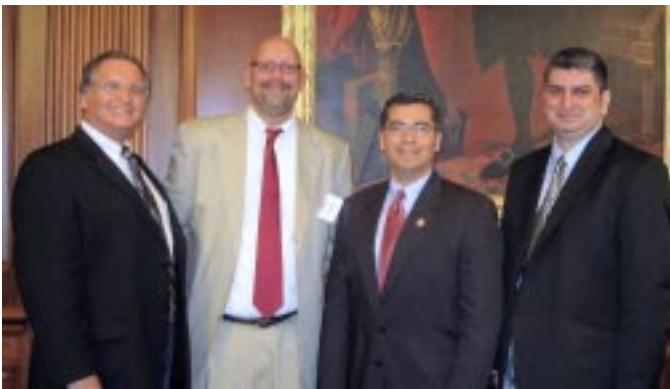
NADE officers met with Congressman Xavier Becerra (third from left), Ranking Minority Member of the Social Security Subcommittee in the House of Representatives.

The week spent by the NADE leadership traversing the SSA and the Halls of Congress proved to be very productive. NADE will continue to pursue its legislative agenda in the months ahead and NADE members are urged to review NADE's Top Issues for 2011 and encourage their congressional representatives to be supportive.