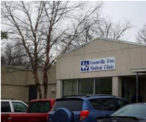
Greenville Free Medical Clinic